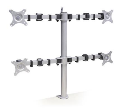
MON4 Height adjustable quad flat screen arm, with desk clamp