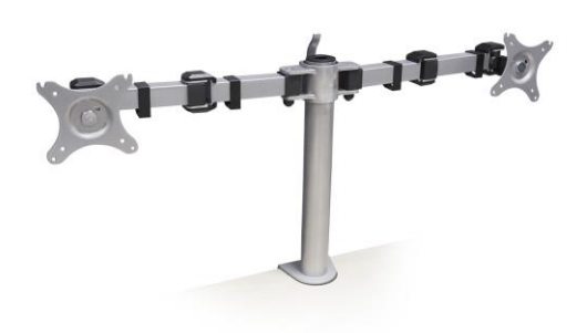
MON2 Height adjustable double flat screen arm, with desk clamp and through desk fixing

MON1 Height adjustable single flat screen arm, with desk clamp and through desk fixing